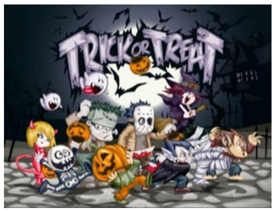
City of Highland Heights Kids Halloween Party