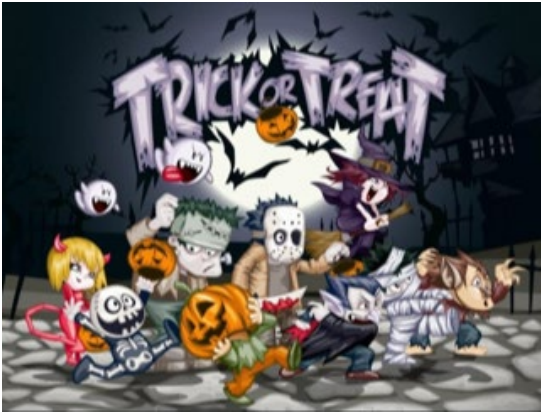
City of Highland Heights Kids Halloween Party